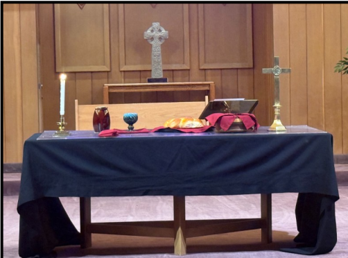
We gathered for communion on Maundy Thursday.