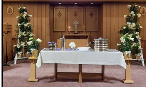
Christ is risen! Alleluia!